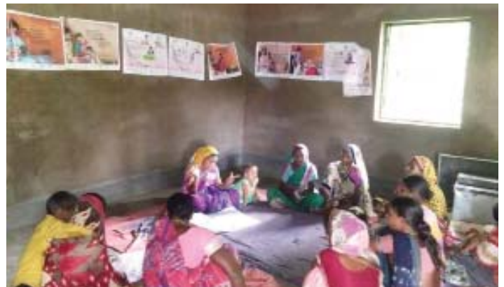
Poshan Mah discussions at Khirakhar, Nawalgarh