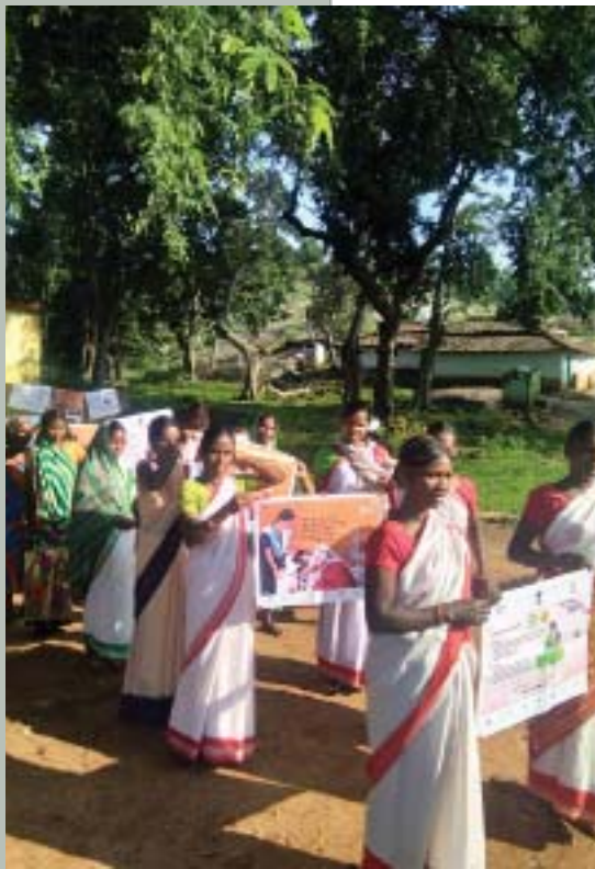
Poshan rally at Patratu, Gola