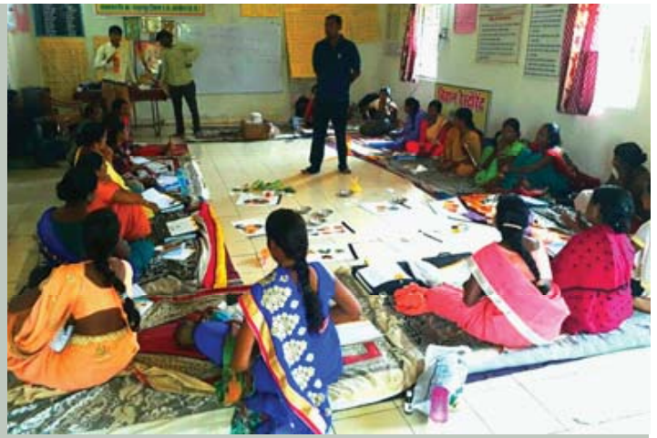
2nd Batch of CV Training in Umradha Cluster