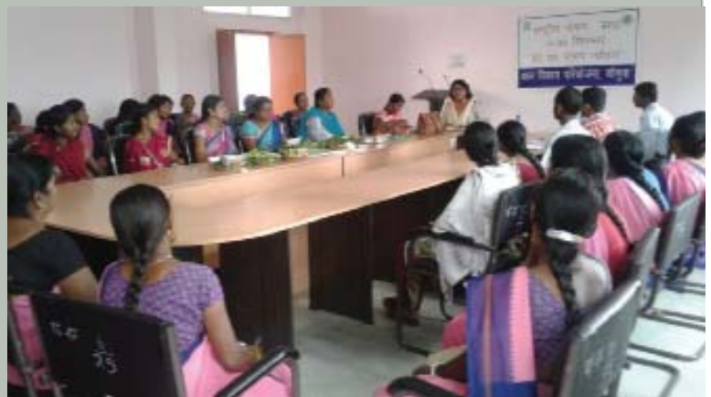
Convergence meeting at block level - Sonua