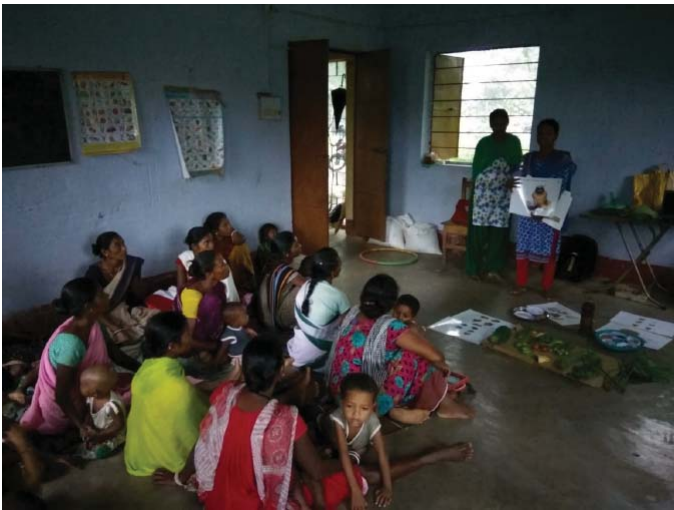
Eat helthy food discussion in Sonuna