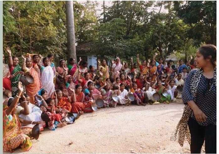
Lohe ka Kadahi Abhiyan at Ranidih village

these 614 women buying and using the iron vessels for cooking vegetables and fighting against anaemia, other women of the community got interested and plan to buy them within a week after discussing with their SHGs. Three villages - Ranidih, Ichag 1 and Boro Puhara - aim to make the Abhiyan 100% successful by starting cooking in iron vessels in each and every house.