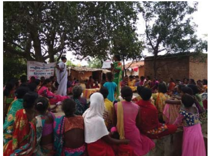
Poshan discussed at village level