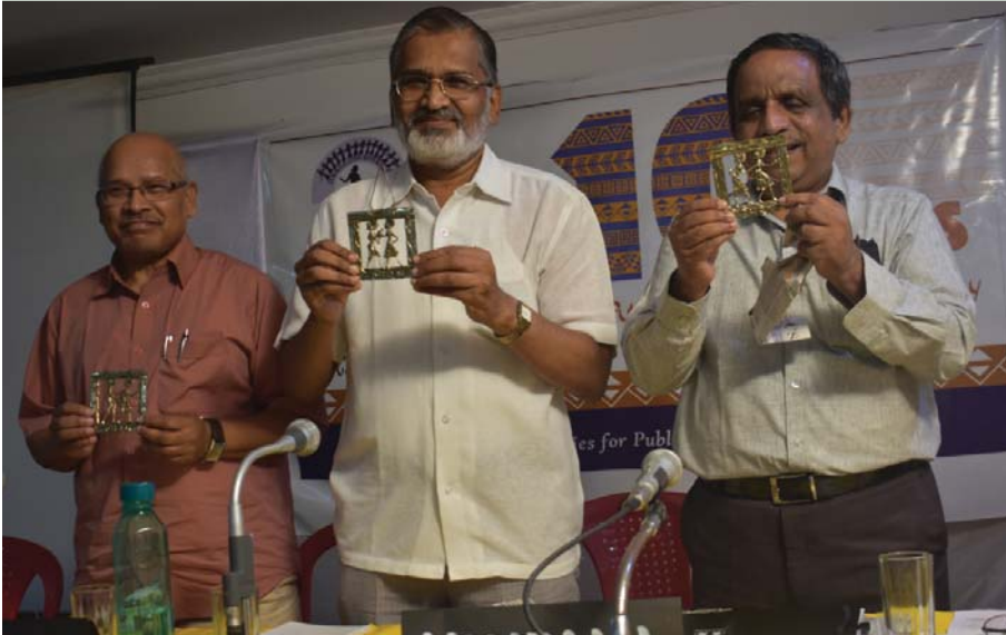
Presenting the souvenir