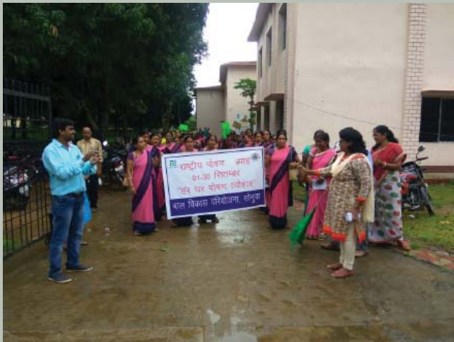
Convergence with ICDS Poshan Mah