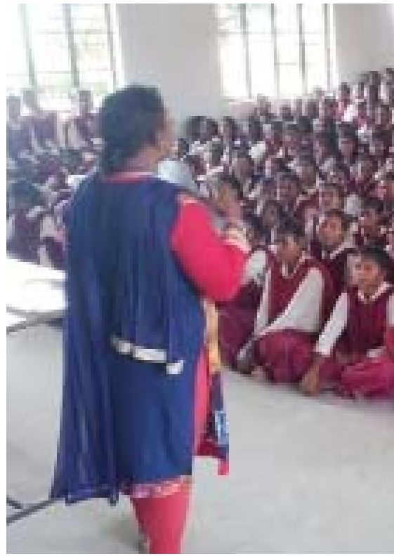
Discussions with adolescents at Hari High School, Torpa