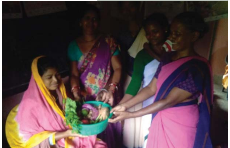
Godhbharai at Chapidih in Raidih

Poshan Mah was celebrated in September in convergence with Department of Women and Child and Social Security in 5 blocks of 5 districts of Jharkhand. As part of the FAAM and PRIDE projects, the Jharkhand team of PHRS was integrally involved in the celebrations in schools, VOs and AWCs across the districts of Godda, West Singhbhum, Ramgarh, Gumla and Khunti. SHG members and adolescents, VO members, ward members, panchayat samiti members, as well as the mukhiyas participated in these events. The celebration was initiated by a team comprising of the local anganwadi workers, ANMs, sahiyas, nodal teachers, change vectors and mentors from the project, who were further supported by the CDPO, BDO and BEO at the block level. The Director of the Department of Women and Child and Social Security also encouraged the team.