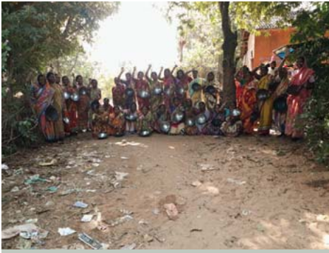
Lohe ka Kadahi Abhiyan at Boro Puhara village

organised by village organisation (VO), identified 465 women out of 521 were anaemic. After the women got the report about their own or their children's haemoglobin test results. Three Upasanghas took the initiative and started the Lohe Ka Kadahi Abhiyan at community level. A total of 614 iron kadahis have been brought and are in regular use in 91 hamlets. Observing