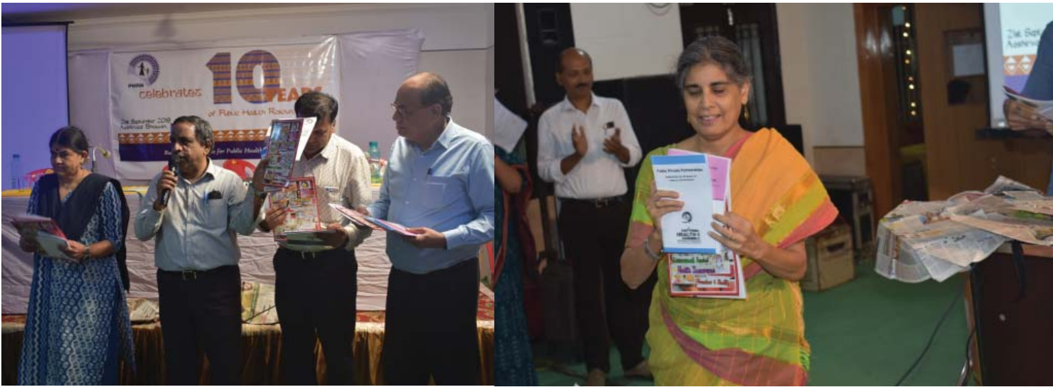
Release of Health Primers