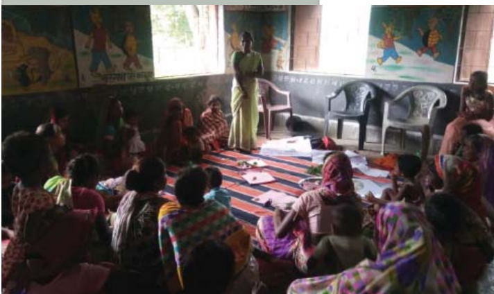
Poshan Mah discussions at Kemte AWC