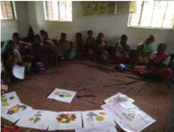
Poshan Mah discussion at Pogra AWC - a PHRN and PRADHAN invitatie

With a core focus on nutrition, many events such as rallies, VO discussions, 'godhbharai' celebrations, 'annaprasan' celebrations, school discussions, etc., were conducted to attract attention to relevant issues. Women and adolescents gained a platform to discuss issues of food and nutrition, teen rangon ka thali, importance of iron and folic acid supplementation, hygiene and sanitation, infant and young child feeding, anaemia prevention, antenatal and postnatal care, and needs during adolescence. Furthermore, the different nutrition-related schemes and programmes of the government were also highlighted to create awareness. More specifically, ICDS services including village health and nutrition day, growth monitoring at AWC, growth chart preparation, counselling for adolescent girls, as well as pregnant and lactating women, antenatal checkups and immunization were given special attention in the platforms.