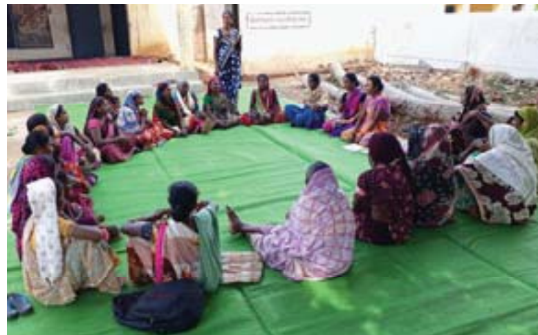
PLA meeting in Charbhatti Village on MM2