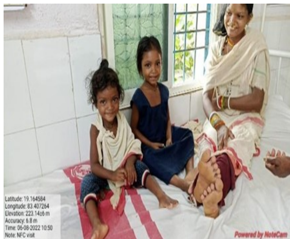
Latitude: 19.164584 Longitude: 83.407264 Elevation: 223.1426 m Accuracy: 6.8 m Time: 09-08-2022 10:50 Note: NRC visit