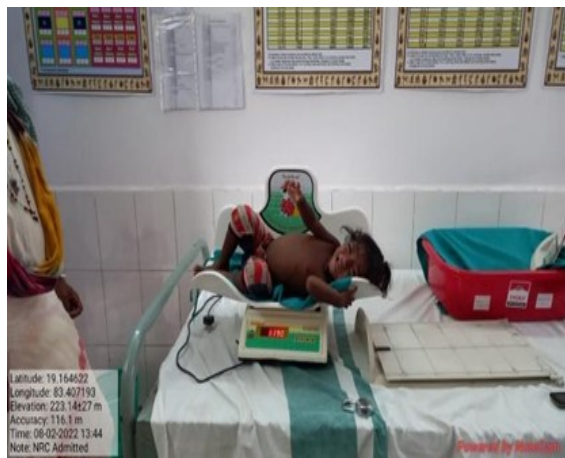
Latitude: 19.164622 Longitude: 83.407193 Elevation: 223.1427 m Accuracy: 116.1 m Time: 08-02-2022 13:44 Note: NRC Admitted