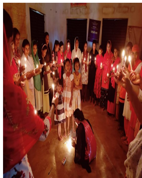
Photograph 1: Lamps lit in support of the girl child in a village of Madhupur

The National Foundation of India held a consultation on 14th and 15th of December 2022 to constitute a Community of Practice for Social Protection for Nutrition- (CoP-SP4N). The need for the consultation was to chart out ways to listen to voices from the ground, document them and further discuss how to integrate them into policy interventions with reference to ICDS, MDM, MGNREGA, Social Pension Scheme and maternity entitlement amongst others. It would also provide for a space to build a consensus on a route map required to make Community Surveillance for social protection of nutrition equitable.