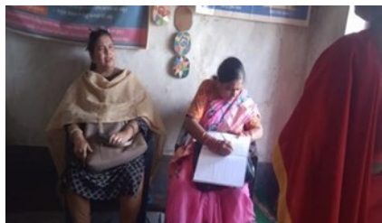
AWC-Penthakata-Pre-school activities (Support by a PHRS, Puri, volunteer

The guest of honour praises our activity and informs us to ensure all the efforts needed to be done at the village to enroll all the children aged 6 months to 3 years