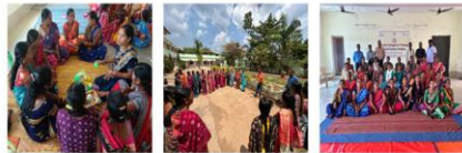
Creche caregivers refresher training for EKTA

May 2024 saw several comprehensive caregiver training sessions. From May 8-10, Swasthya Swaraj organized a training in Thuamulrampur, Kalahandi, which included practical demonstrations and interactive activities on malnutrition, infant feeding, hygiene, meal planning, first aid, and creche committee establishment. EKTA held a refresher training from May 20-22 in Koraput, and SOVA conducted another from May 28-30 in Koraput, both focusing on reinforcing caregivers' skills in managing creches and ensuring proper nutrition. These sessions, led by experts from PHRS and supported by supervisory teams, equipped caregivers with essential knowledge and skills, ensuring high-quality care for children in the creches.