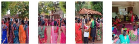
Creche caregivers training for Swasthya Swaraj